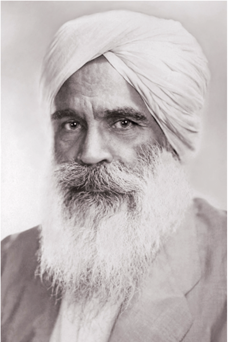
Sant Kirpal Singh Ji (1894-1974)