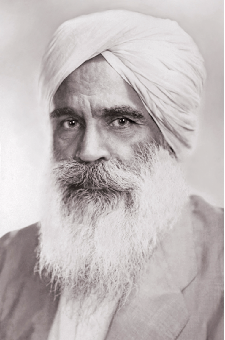
Sant Kirpal Singh Ji (1894-1974)